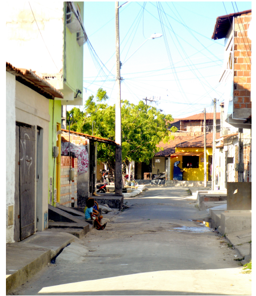
Above: A street view as you enter São Cristóvão.