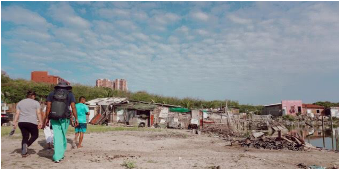
Pictured is an American medical team entering one of the slums in Fortaleza, Brazil.