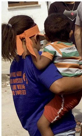
Avery carries a boy during favela outreach.